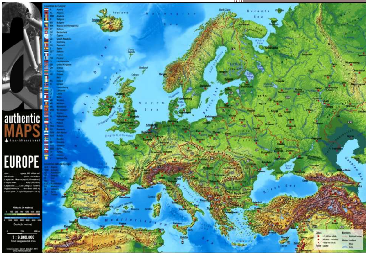
The European Continent Wall Map in 3D

Introducing Innovative Educational Material and their application in class through the use of appealing True-3D material.